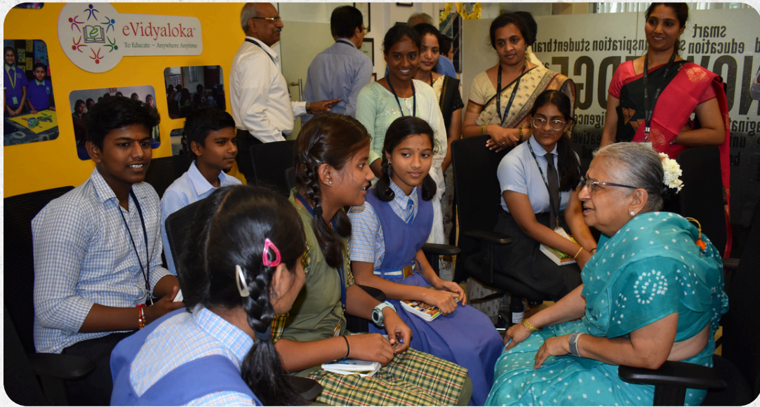
Mrs. Sudha Murty interacting with children at the eVidyaloka office, Bengaluru.

The EmpowerED program addresses critical challenges such as limited technology access, digital literacy gaps, and gender disparity in STEM education. With a curriculum focused on digital literacy, coding, and AI for Grades 6 to 9, the program fosters holistic development, aligns with key UN Sustainable Development Goals (SDGs), and contributes to community empowerment by training women from the local community as Class Assistants.